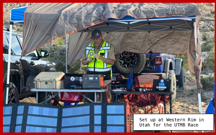
Set up at Western Rim in Utah for the UTMB Race