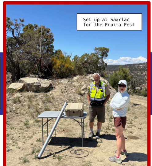
Set up at Saarlac for the Fruita Fest